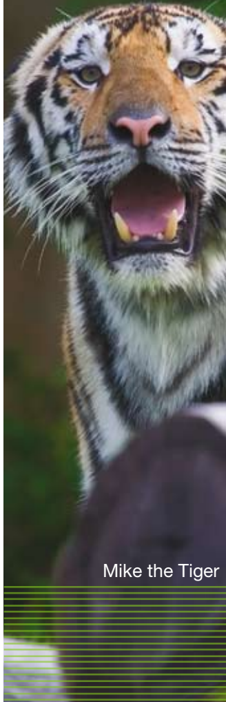
Mike the Tiger

Stop by the LSU Visitor Center to obtain a visitor parking hangtag and campus map. Visitors may park in student lots, pay-to-park lots, and metered spaces.